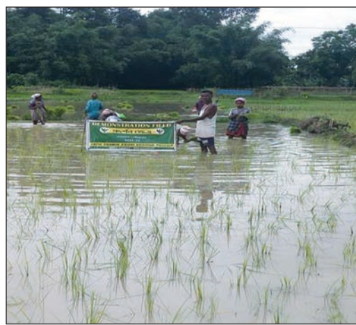
Demo. For paddy crop