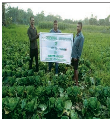
AGKUP Ceremonial harvesting - Vegetables

The project has driven farmers in Assam towards self-reliance and improved earnings.