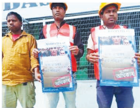
Observance of World Safe Day

Among the notable public events the WORLD SAFE DAY was observed in Tea estates on 28th . April 2023.