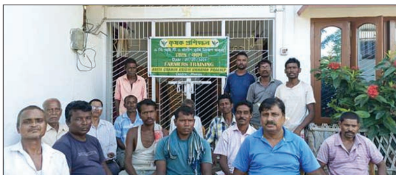
Field Training of farmers under ABITA Gramin Krishi Unnayan Prakalpa