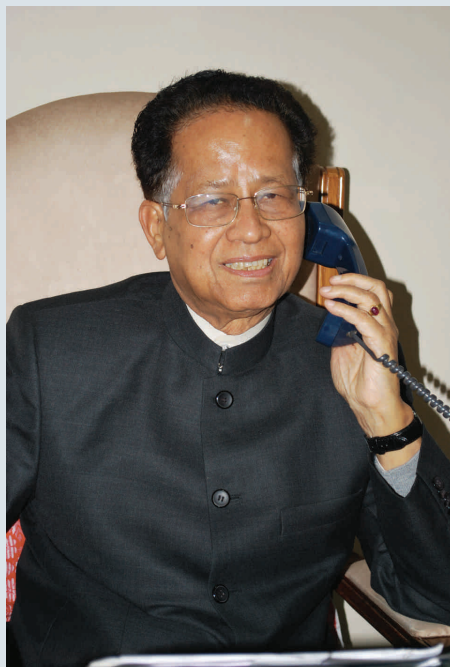
Tarun Gogoi, Chief Minister, Government of Assam

ABITA, met Tarun Gogoi, Chief Minister, Pradyot Bordoloi, Minister for Industries and Commerce, Power (Electricity), Public Enterprise and N K Das, Chief Secretary, Government of Assam, on December 11, 2012 at Guwahati. The issues discussed at the meeting included: