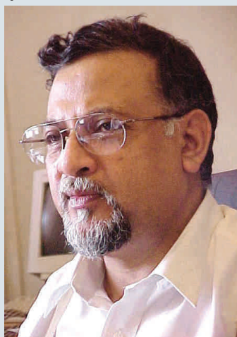
N K Das, Chief Secretary, Government of Assam

A representation was submitted to the Government of Assam to request the Ministry of Petroleum and Natural Gas for allotment of gas on priority to these affected tea estates under the NDZ. The Chief Secretary, Government of Assam, assured that a letter would be addressed to the Ministry of Petroleum and Natural Gas, Government of India. The Minister of Industries suggested that the tea industry should explore installing equipment that could substantially bring down emission caused by coal usage.