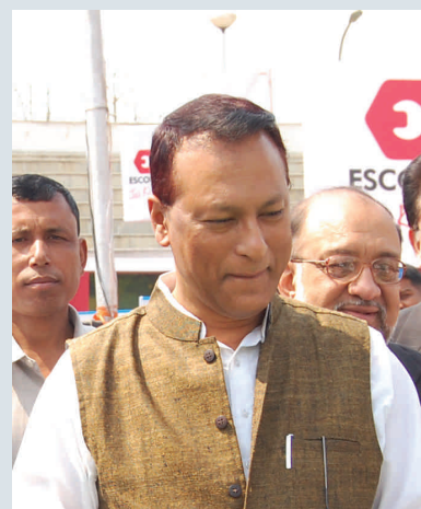
Prodyut Bordoloi, Industries and Commerce Minister, Government of Assam

■ Tea garden land usage for oil exploration: The Minister for Industries pointed out that tea companies were providing tea estate land to Oil India/ ONGC for oil exploration in lieu of compensation, without the permission of the District Collector. This was resulting in tension among the tea labour community and causing revenue loss to the State. ITA agreed that it would bring this to the notice of all Constituents and members so that prior to parting with land, permission of the Collector would be taken in all cases.