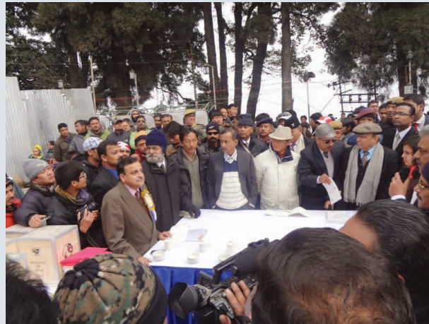
Charity Auction at the Darjeeling Tea and Tourism Festival