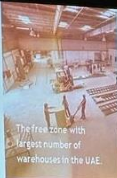
The free zone with largest number of warehouses in the UAE.